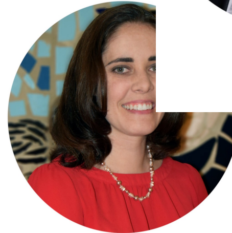
Elizabeth Wingfield Graduate College of Social Work