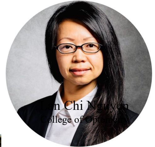
An Chi Nguyen College of Optometry