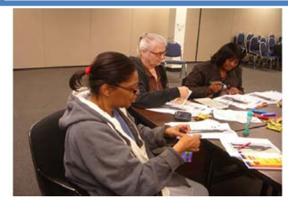
Foster parents work to identify myriad foster child needs in this activity.