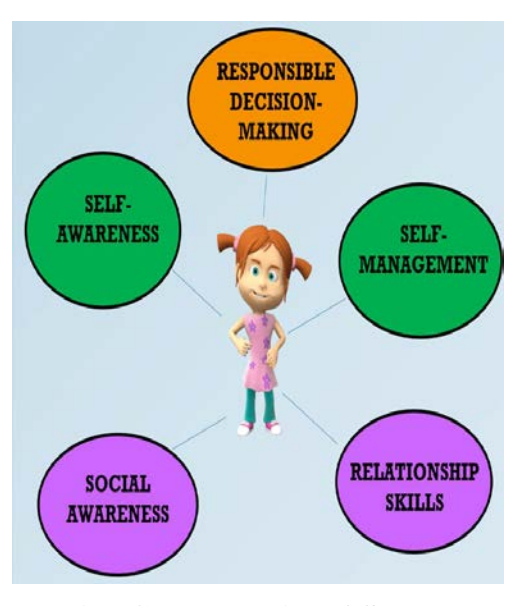
Five Competencies of SEL

"Social and emotional learning (SEL) is the process through which children and adults acquire and effectively apply the knowledge, attitudes, and skills necessary to understand and manage emotions, set and achieve positive goals, feel and show empathy for others, establish and maintain positive relationships, and make responsible decisions." — www.casel.org