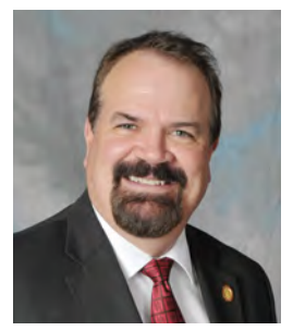
Letter from the Dean