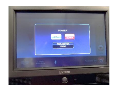
Shut Down System Screen