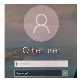
Other user Screen