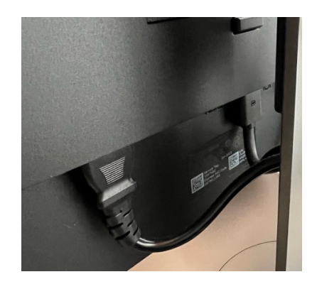
UGLY #11 INTENT WAS GOOD BAD PLACEMENT.