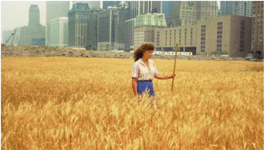
Fig 3. Denes, Agnes. Wheatfield – A Confrontation . 1982, Two acres of wheat planted and harvested by the artist on the Battery Park landfill, Manhattan. Commissioned by Public Art Fund.

Agnes Denes’ Wheatfield – A Confrontation (1982) (Fig. 3) models a frameless and immersive approach to artistic engagement of the natural world.