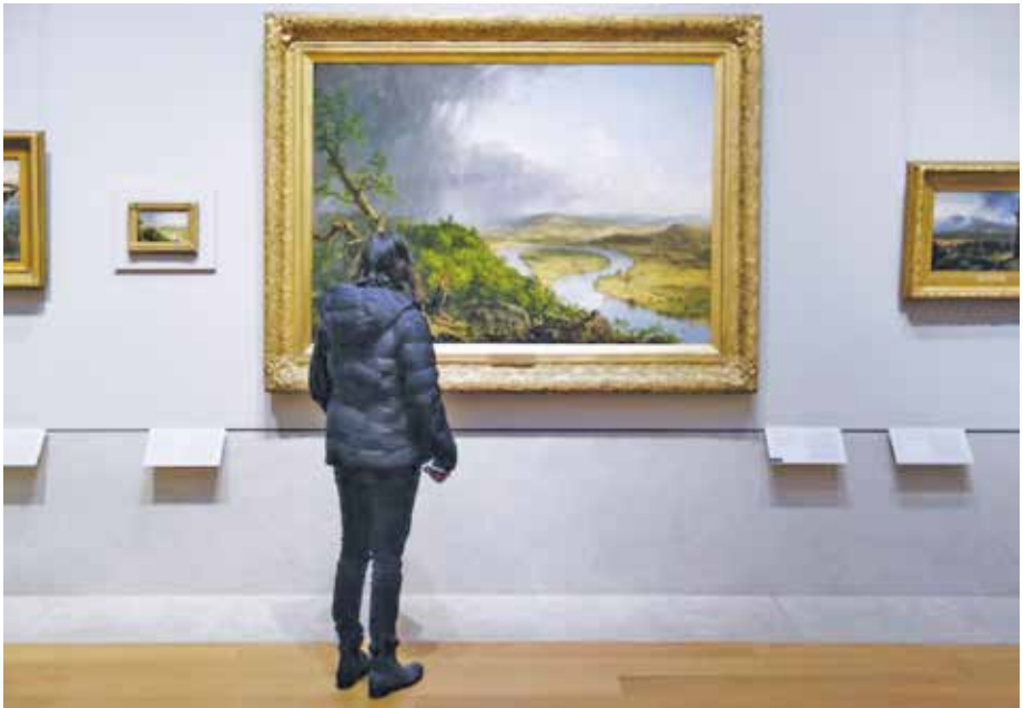
Fig 1. Looking at Thomas Cole, View from Mount Holyoke, Northampton, Massachusetts, after a Thunderstorm (The Oxbow) , 1836, oil on canvas, 130.8 x 193 cm (The Metropolitan Museum of Art)

We see the frame as both a physical boundary and ideological limitation in Thomas Cole’s The Oxbow ( The Connecticut River Near Northampton ) (1836) (Fig. 1). A founding member of the acclaimed Hudson River School of painting in 19th century New England, Cole specialized in pictorial represen-