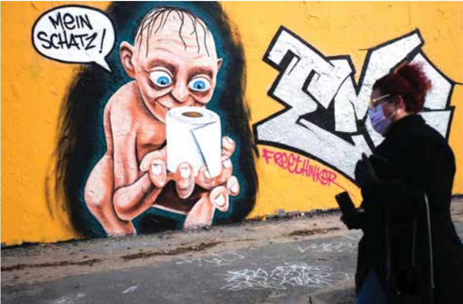
Fig 1. Street art in Germany

to disruptions. The patterned embodied behaviors by which toilet paper was distributed, bought, and stored shifted as consumers attempted to manage the randomness, to mitigate the disorientation of their state of liminality.