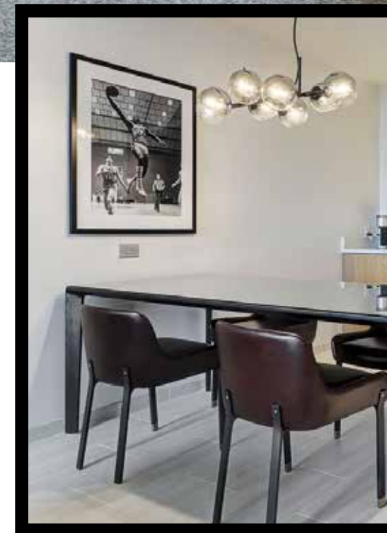
Two additional photographs display a hotel suite featuring photography provided by the University of Houston, showcasing the university's marching band and athletic teams.

Our guests are telling us we're doing a great job! Year to date, we are rated in the top 22% of all Hiltons in North America, for overall service, and in the top 8% for cleanliness. In the third quarter of 2023, our hotel was ranked in the top 2% nationally for cleanliness, and 5% in service. We've set our goal to be #1 in 2024!