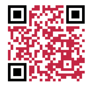
Have You Completed Your Graduation Checklist?