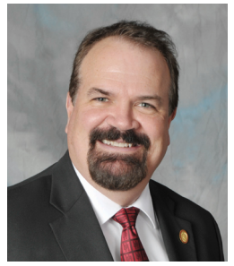
Letter from the Dean