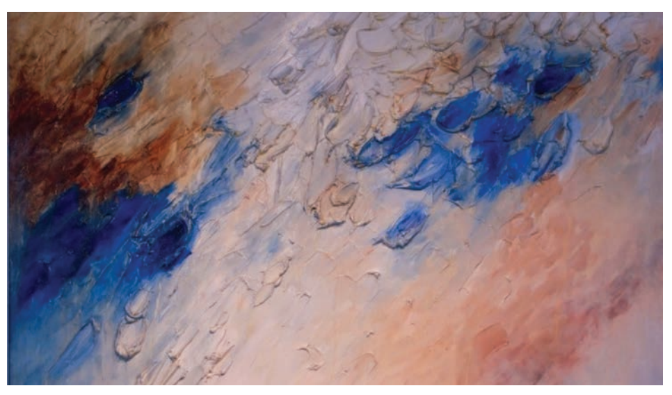
Ocean, Oil on Canvas 48"x55", 2013, Hanh Tran