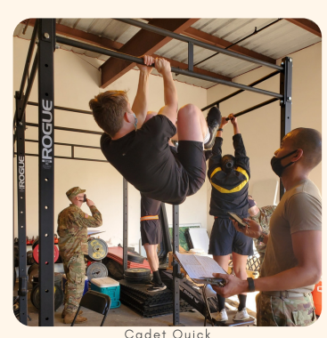
University of Houston

On Wednesday, November 18, all contracted Cadets participated in the new Army Combat Fitness Test (ACFT). The Army Combat Fitness Test consists of six events: 3 repetition strength deadlifts, a standing power throw, arm extension push-ups, a 250-meter sprint-drag-carry, leg tucks, and a 2-mile Run. All Cadets worked hard and got an opportunity to gauge their strengths in this new Army Physical Training test.