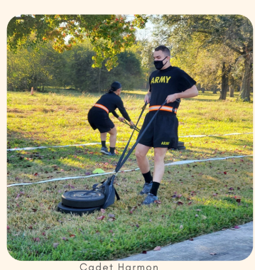
University of Houston