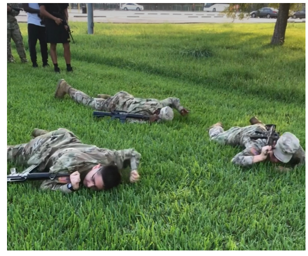
Cadets vigorously participate in lab every Friday practicing tactics and leadership skills.