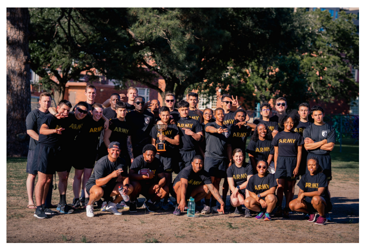
Houston Battalion Army ROTC wins the Annual ROTC cup for the third year in a row against the Navy, Air Force, and Marine ROTC programs.

Throughout the spring semester, cadets diligently attended physical training sessions three times a week, actively participating in a range of events including ruck marches, group runs, and various exercises. As the semester came to a close, they underwent a record Army Combat Fitness Test to assess their abilities and successfully completed a challenging 12-mile ruck.